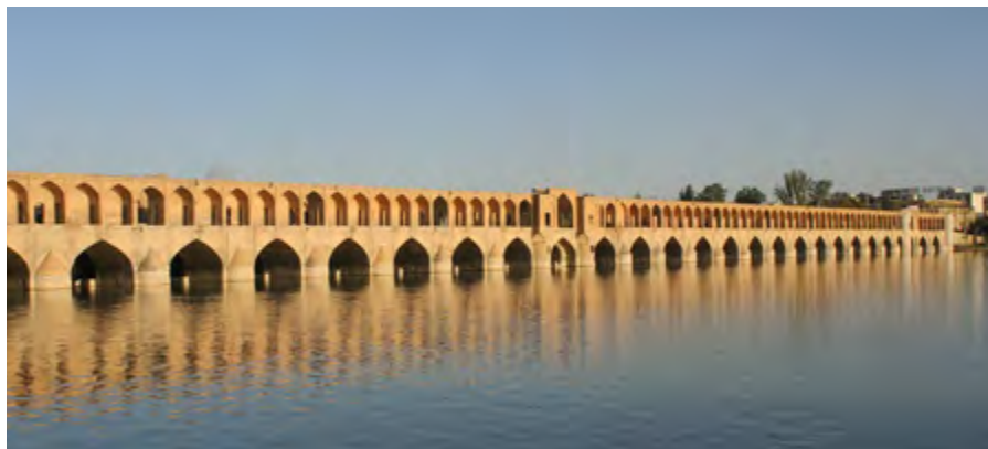
One of the Majestic bridges built by Shah Abbas I in Isfahan, XVth c.

A coup d'état in 1921 brought Reza Khan to power.