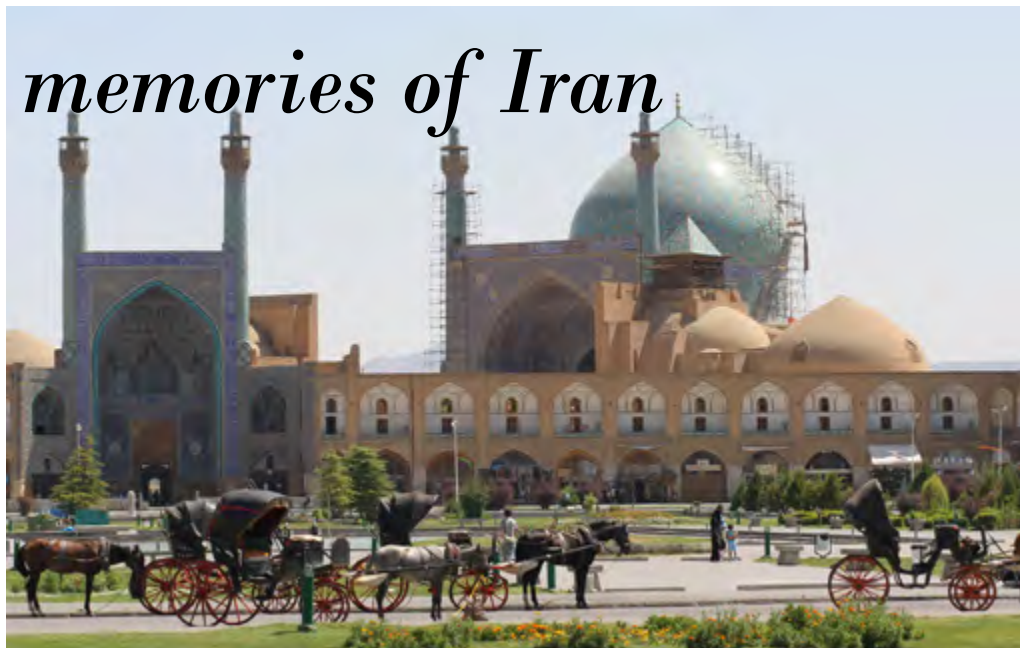
The famous Imam Mosque and its minarets, Isfahan

Having lived in Lebanon, one of the Middle Eastern countries, I had the opportunity in the early 70's to visit Iran during one of my husband's assignments abroad. At the time, the country was still under the reign of Shah Reza Pahlavi. A one month stay gave me ample time to visit Teheran, Isfahan, Shiraz, and Persepolis , exploring the souks, the market places where spices, a myriad of food products and other handwoven items are made. You would also come around precious carpets with elaborate patterns and brass and silver containers, trays, tea cups, saucers, coffee pots with creative designs. Quite often, carpet weaving was done by women, sitting in front of their loom passing and intertwining woolen and silk threads with amazing ability, while brass or silver work was done by young apprentices sitting outside their shops, intent at hammering their objects, where passers by could see and admire their work at hand.