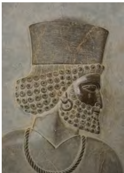
Persian soldier from the archaeological site of Persepolis

Though the size of Persia is considerably reduced in the XIXth century during the Qajar Dynasty, Iran has a total area of 1,648,195 sq.km, equivalent to the total area of U.K., France, Spain and Germany put together, with a population of 80,840,713 (2014 estimate). Known to the Western world as Persia since 1935, it is home to one of the most ancient civilizations.